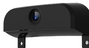
Thermal Sensor Module